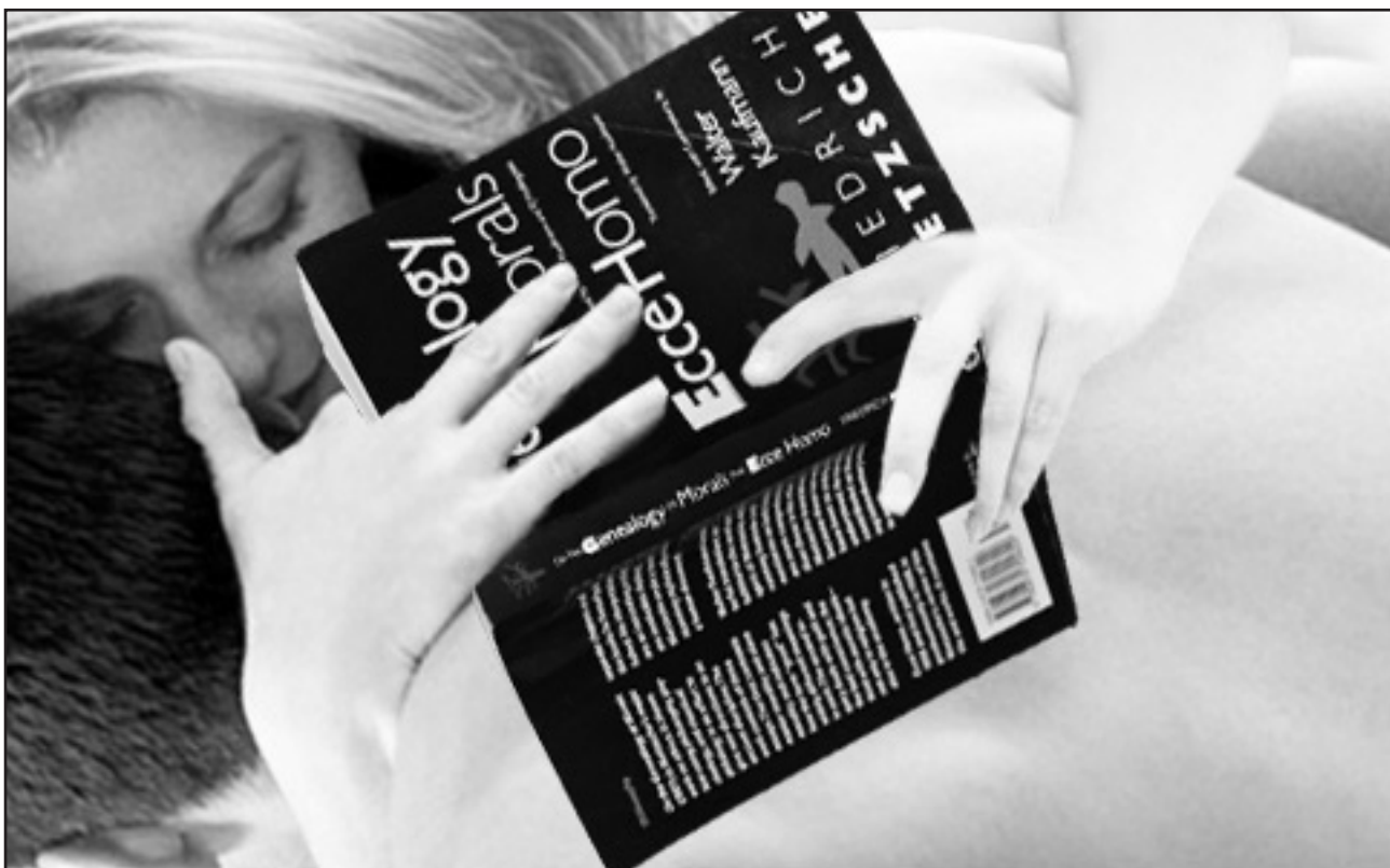
Above: Veronica Rhodes '11 brushes up on a little Nietzsche while brushing up on a little French.

LOOSE—According to a recent study, approximately 69% of Grinnell students do homework during sex. Apparently, papers are in danger of more than coffee stains.