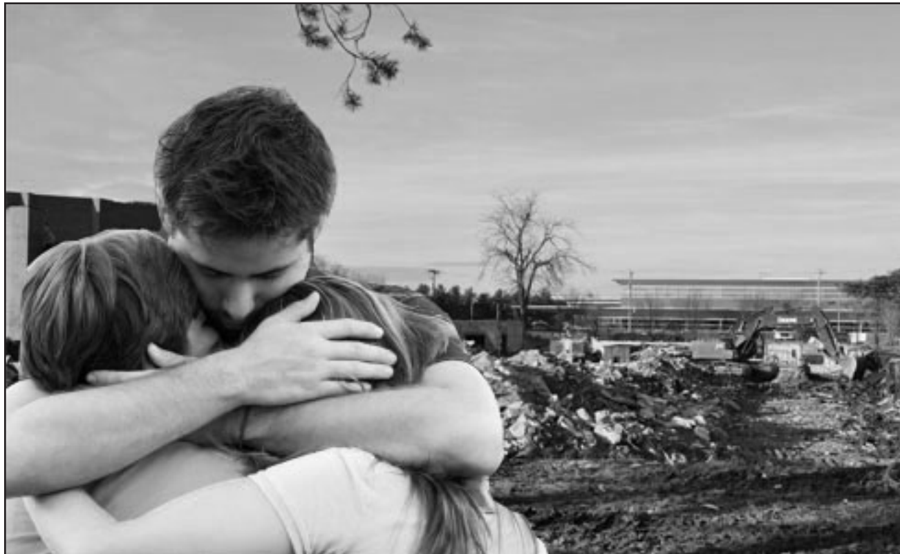
Above: Students embrace during a Grief and Loss event with CRSSJ for those close to the deceased.

always wanted to be in a Tit Head film.”