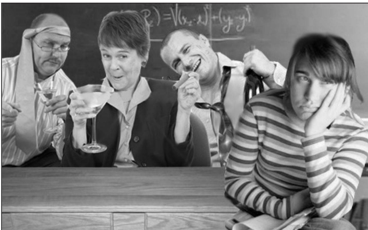
Above: A student worries that Grinnell’s alcohol culture may be adversely affecting the academic performance of his professors.